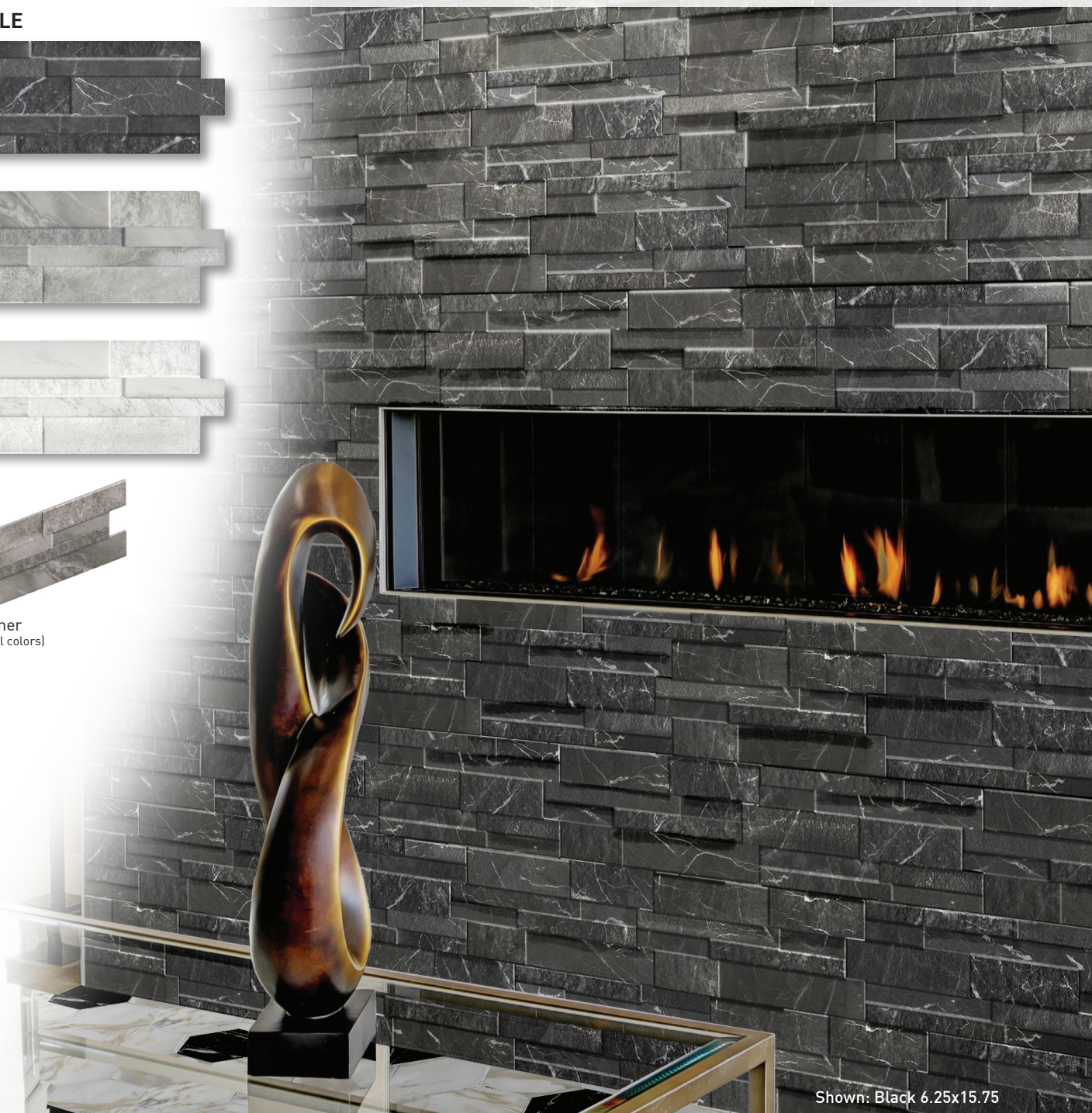
Shown: Black 6.25x15.75