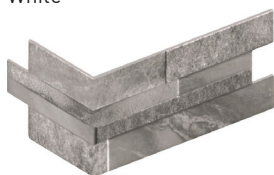
8.75x6 Corner (Available in all colors)